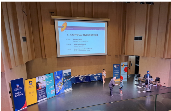
HAYDEN'S AWARD ACCEPTANCE

Congratulations Hayden , we are all very proud of you.