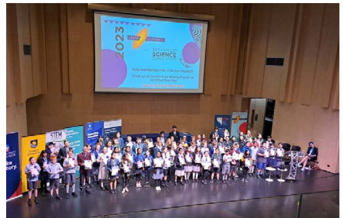
ALL THE YEAR 5-8 OLIPHANT SCIENCE AWARDS WINNERS